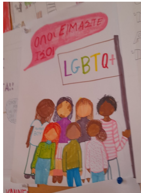
Title translated: The ways we are.